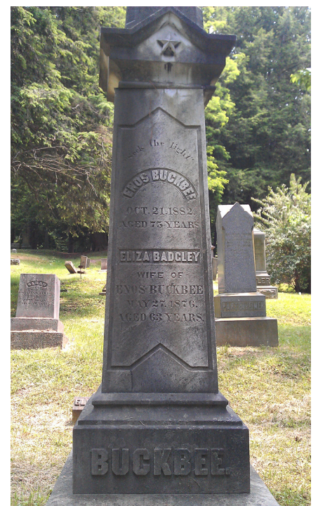
Enos Buckbee "Seek the Light" August 2012